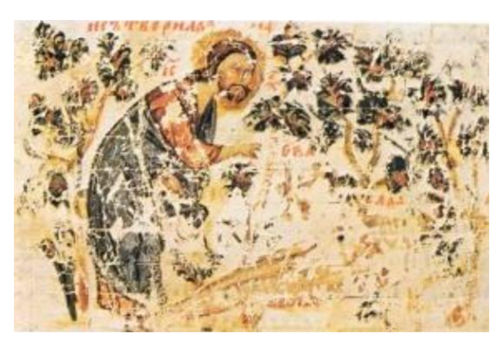
Figure 5. Jesus Christ in the role of "the creator of Adam and Eve" on one of the miniatures of the famous Bulgarian manuscript with the translation of the Manasses Chronicle [Dzhurova, Dimitrov, 1979].

On one of the miniatures of the famous Bulgarian manuscript with the translation of the Manasses Chronicle, we see Jesus Christ as "the creator of Adam and Eve" ( Figure 5 ). It thus appears that Jesus existed long before the birth of Virgin Mary, and therefore can not be her Son in the physical sense; that He is the only God Whom the Catholics and Orthodox share in three parts – the Father, the Son and the Holy Spirit.