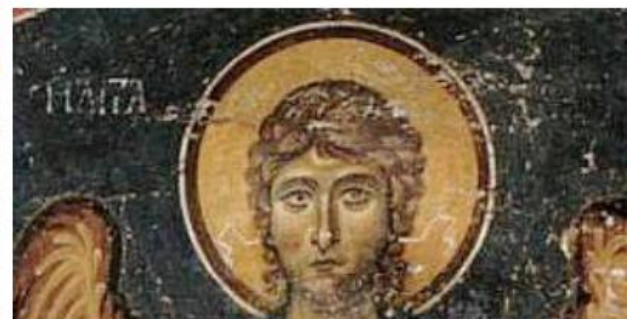
Figure 7. Left: Holy Trinity. Fresco in the Cathedral of Our Lady of the Monastery of St. John the Theologian on Patmos Island [Collection of Icons, 2019]. The end of the XII c. Right: detail of this fresco.