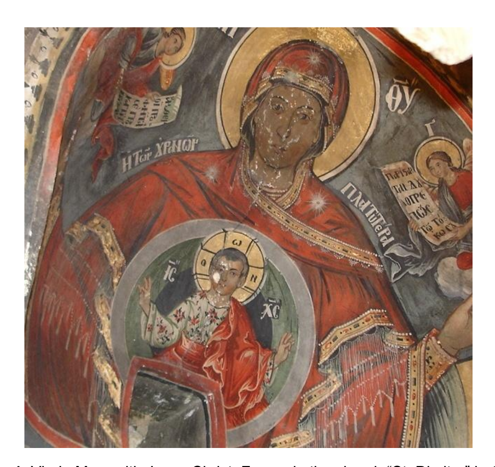
Figure 1. Virgin Mary with Jesus Christ. Fresco in the church "St. Dimitar" in Ohrid.

The circular "mandorla" in which Jesus is depicted is in fact the "channel" through which He descends to the Earth; the concentric circles in the mandorla are images of the crystal spheres that, according to the perceptions of the medieval science about the Universe, are between the globular Earth – the center of the Universe – and the Heavenly Sphere of the fixed stars, behind which is the Empireus, the expanse of God and the angels.