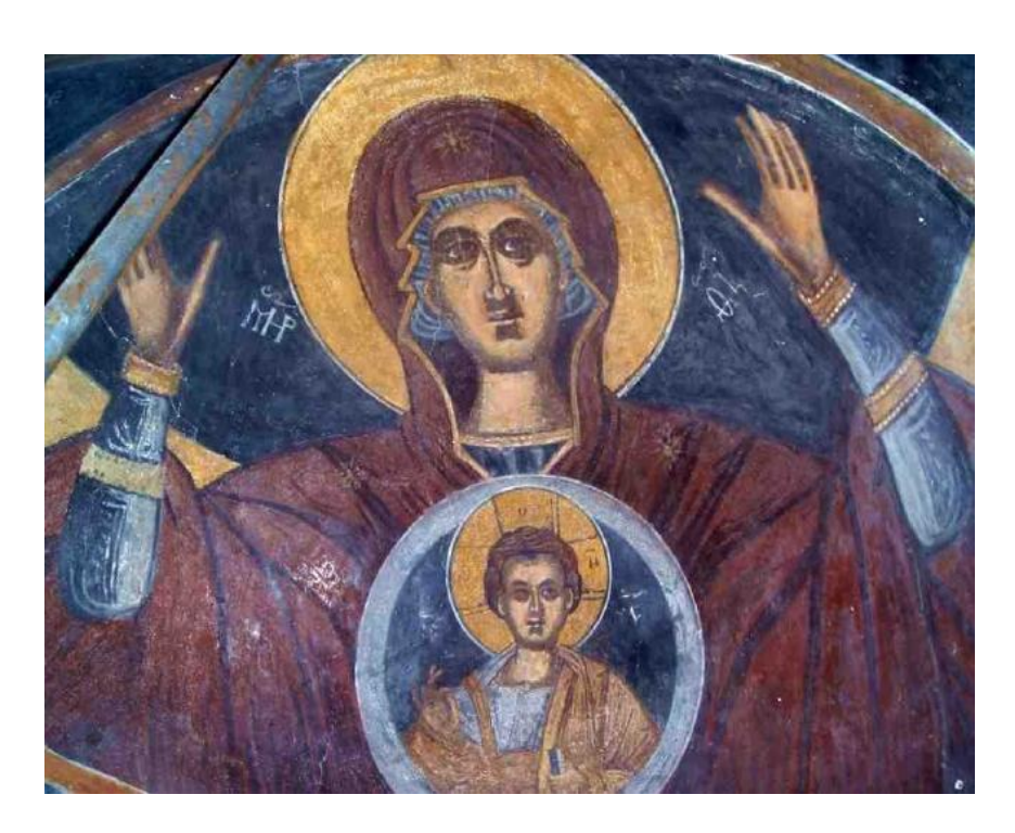
Figure 2. Virgin Mary Oranta. Fresco in the church "St. Petka" in the village of Vukovo, Western Bulgaria [Church of St Petka, 2019].