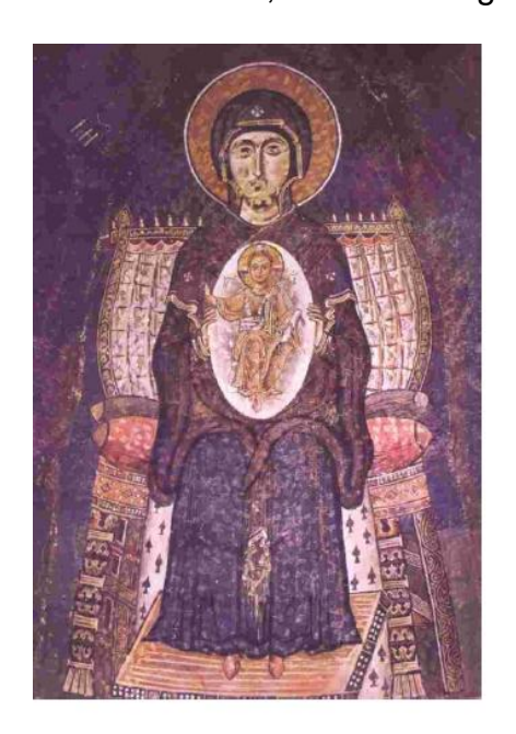
Figure 3. Virgin Mary Nicopea. 11th century. Partly restored fresco in the apse of the church "St. Sofia" in Ohrid [Chausidis, 2003, 428].