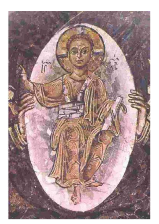
Figure 4. Jesus Christ. Fragment of the fresco "Virgin Mary Nicopea" in the apse of the church "St. Sofia" in Ohrid.