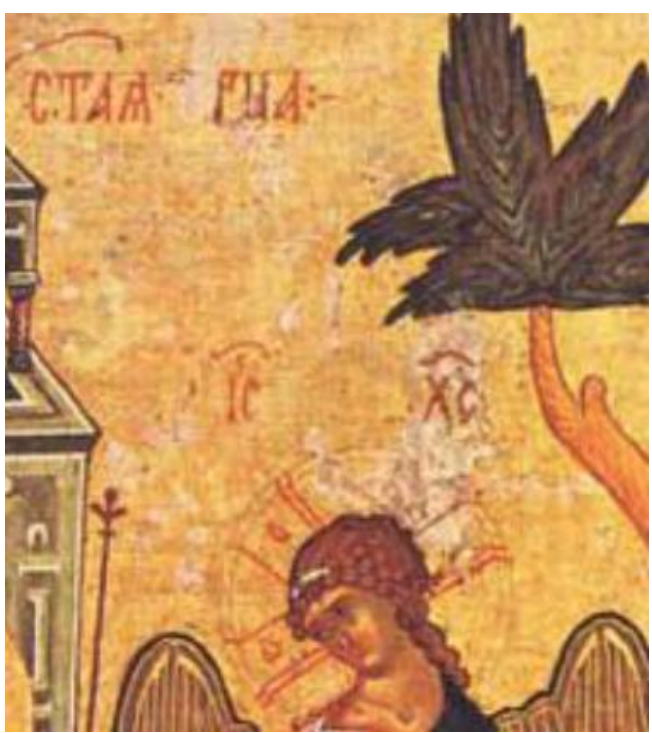
Figure 9. Up: Holy Trinity. The end of the XV c. Icon in Cathedral of St. Sophia in Novgorod [Russkaya Ikona, 2019]. Down: detail of this icon.